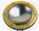
MODEL RPD300Ti IC: 29.001.006 APPLICATION D300Ti D305Ti MODEL RPD400Ti IC: 29.001.009 APPLICATION D400Ti D405Ti