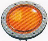
MODEL RPD300 IC: 29.001.004 APPLICATION D300 D305