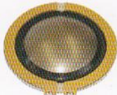
MODEL RPD3300Ti IC: 29.001.013 APPLICATION D3300Ti D3300Ti DPD