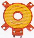
MODEL RPST304 IC: 29.002.002 APPLICATION ST304 ST324