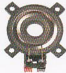
MODEL RPDH200 IC: 29.004.001 APPLICATION DH200HM DH200E